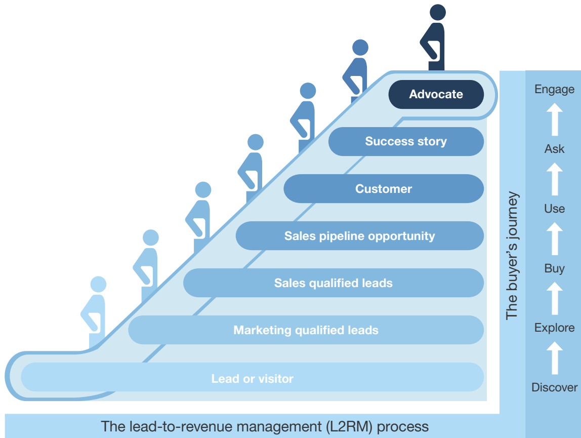
Figure 4 The Lead-To-Revenue Escalator Puts The Focus On Customers, Not On Process