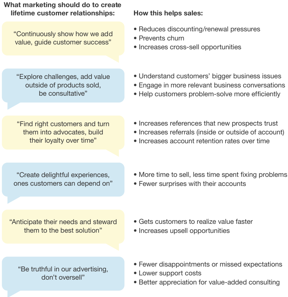
Figure 3 Lifelong Engaged Customer Relationships Deliver Multiple Benefits To Sales