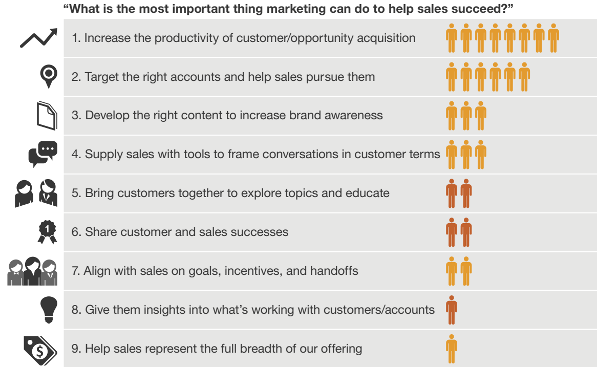
Figure 2 B2B Marketers Focus On Enabling And Not Enough On Engaging

Base: 18 B2B CMOs, marketing leaders, and executives (multiple responses accepted)